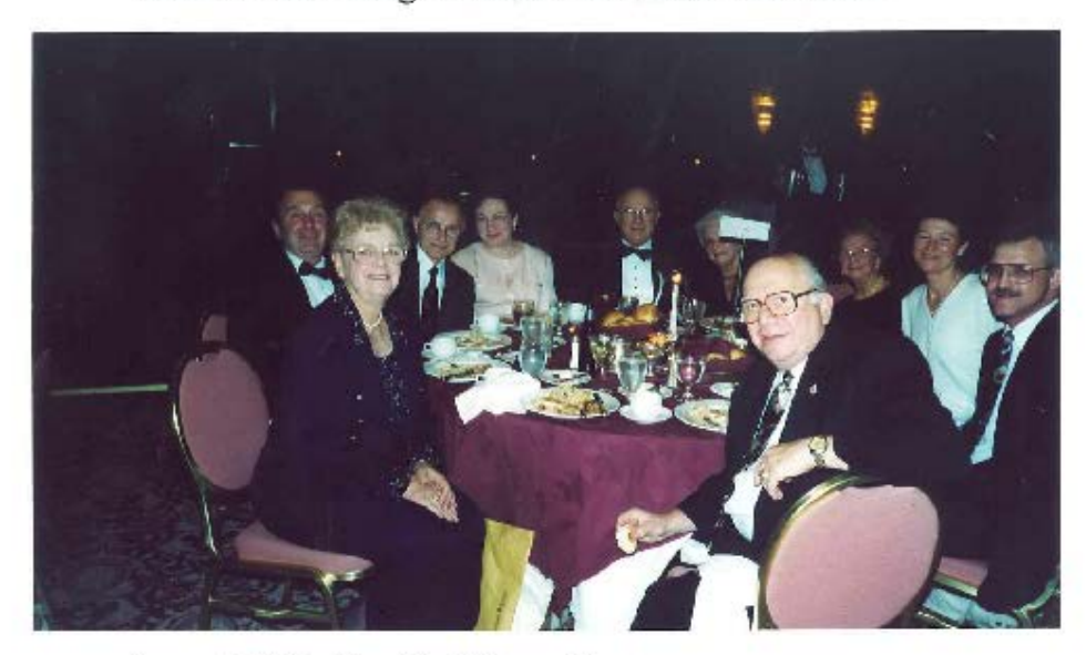
August 1999: West End Dinner Theater