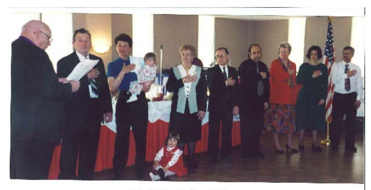
Mar 1999 Installation of Officers