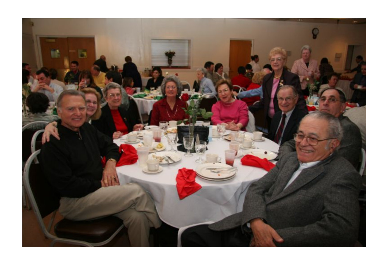
Installation of Officers March 2006