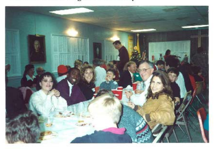
November 1993: New Member Recognition Bunch