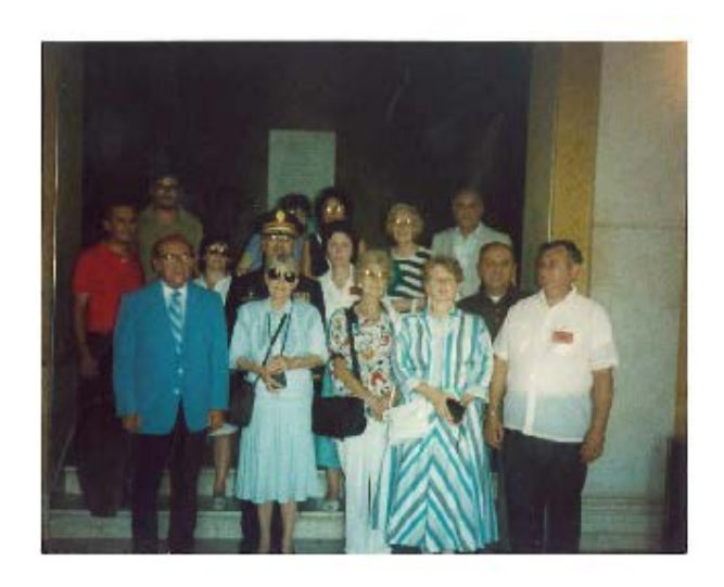
Members of the Italian Heritage Lodge at the 1989 State Convention