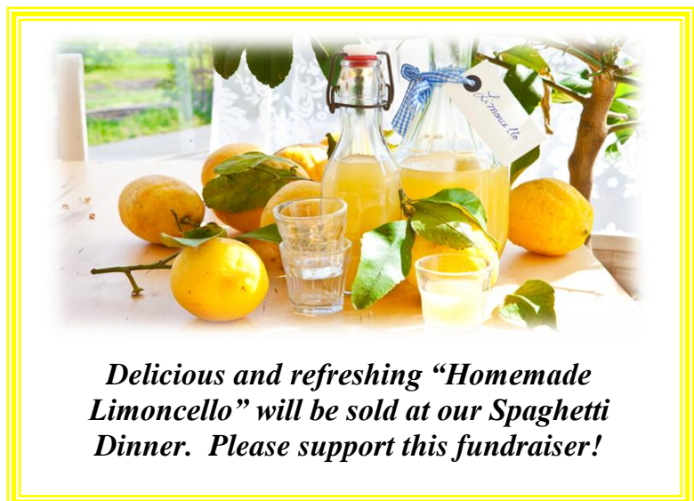
Delicious and refreshing "Homemade Limoncello" will be sold at our Spaghetti Dinner. Please support this fundraiser!