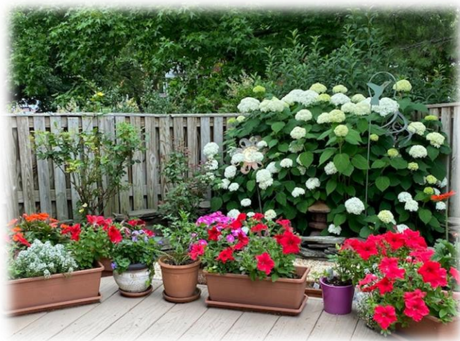
"Pizza Margherita with fresh basil from our garden. Planted flowers and herbs this spring, and just harvested my basil to make fresh pesto (and freeze some for winter)." - Carol Ann Linder