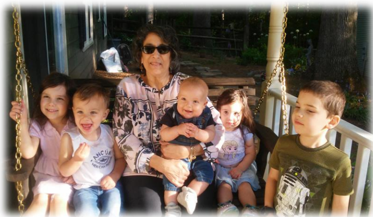
"Sciscilo Strong" ~ Mother's Day 2020