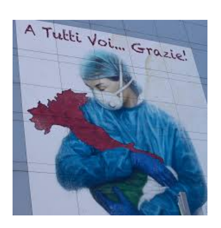
To our dear family and friends in Italy, to your doctors, nurses, health care workers, polizia, religious, and all citizens, our many prayers are being lifted up for you in your time of need.