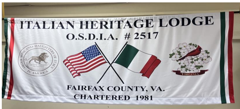
Italian Heritage Lodge banner